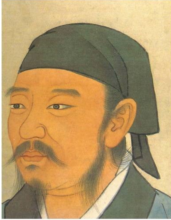
Figure 4. Portrait of Xunzi (300-230 B.C.E.).