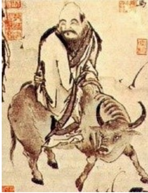
Figure 6. Laozi

Lao Tzu, like Confucius and Mencius, generally rejected a punishment based system of rule, but for different reasons. He rejected the Confucian belief that the public emulated the ruler to any great extent. Although a behavioral connection between ruler and subject is alluded to in the Tao Te Ching , it is a brief and somewhat vague comment, and pales in comparison to the more concrete statements made in the Taoist text that downplay the importance of the relationship between ruler and subject. For the sake of comprehensiveness, the comment connecting ruler and subject in emulation is, “When a ruler lacks faith, so will the people” (Lao Tzu, 2013, p. 17). Instead of ruler intervention, Lao Tzu believed that a deviant will naturally revert to the correct path. As water finds an even plain, he argued, people also possess a moral equilibrium in which they continuously revert. People might stray from the path of virtuousness, but their inherent nature will pull them back to the correct path, back to “the Way.” Lao Tzu (2013) writes of this natural correction or reversion after deviance, “Peace is meant to be our natural state. A whirlwind