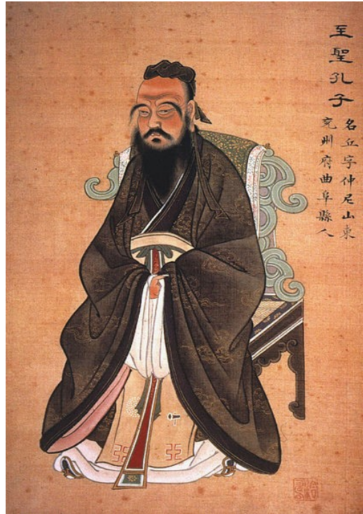
Figure 1. Confucius (551-479 B.C.E.).

Confucius (551-479 B.C.E.) and his disciples were purportedly living in a time of social decline and regional instability. He lived during the late Spring and Autumn Period (770-481 B.C.E.), an age in which moral behavior, personal ethics, and appreciation for the arts was in deterioration throughout the Zhou empire. It was within this social context that Confucius sought individual and societal direction from the sages and sage kings who lived hundreds of years prior to Confucius, in what Confucius thought to be more peaceful and harmonious times. 17 It's important to note again that it is believed that for a significant