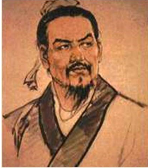
Figure 5. Portrait of Han Fei (280-233 B.C.E.)

Lao Tzu, like Confucius and Mencius, minimized the importance of rewards and punishments. Instead of rewards and punishments, Lao Tzu argued that people are to follow “the Tao” or “the Way.” He did not engage in extremes of large rewards or harsh punishments, he dismissed controlling others using fear tactics, and he generally promoted a rehabilitative and “hands-off” punishment style. He believed that there is no need to punish because the workings of the universe, or “the Tao,” will naturally create order and stability. A peaceful and harmonious society will arise naturally, Lao Tzu contended, without the need for governmental interference; thus, the role of government is to be minimized. Lao Tzu (2013) writes of punishment: