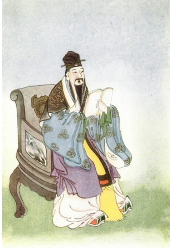
Figure 3. Mencius (372-289 B.C.E.)

Where Confucius developed the skeleton for the Confucian tradition, Mencius (372-289 B.C.E.) added muscle to the bone. Mencius and Confucius make up the twin pillars of Confucianism. The work of Confucius came first, which is a collection of the essential elements of the general theories with a relatively limited range of application and thoroughness, and then Mencius came along approximately one-hundred years after Confucius and greatly expanded upon Confucius' material by providing rich theoretical substance to his concepts and theory. Mencius delved deeper into Confucius' theories, expanded on them, and incorporated many of his own into this philosophical tradition.