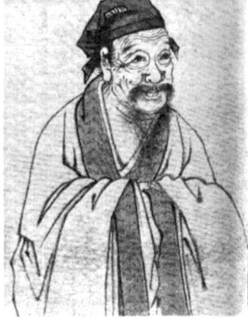
Figure 2. Notable Confucian commentator Zhu Xi (1130-1200 C.E.)

Classical texts, such as those that were examined for this dissertation, are often not easy to understand or interpret in modern times, thus, scholars will often provide interlinear commentary to aid the reader. From the 10 th century to the early 20 th century (which is considered the height of Confucian influence and popularity in Chinese society) it was standard procedure for the Confucian texts to contain interlinear commentary to better explain the original material. A good representative of this interlinear commentary is an eminent Neo-Confucian scholar by the name of Zhu Xi (1130-1200 C.E.). Confucian texts often contain important interlinear commentary written by a scholar like Zhu Xi. Zhu Xi is likely the most well-known and well-regarded Confucian commentator, and his commentary (and commentary like his) was frequently sought throughout this dissertation for clarification and explanatory purposes. Notable Confucian scholar and translator James Legge explains the influence of Zhu Xi on Confucian scholarship: